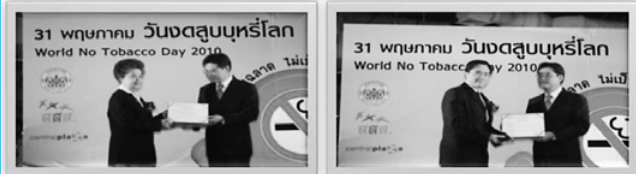
May 31, 2010