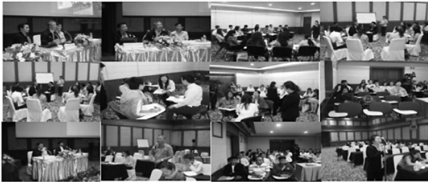
Thai Tobacco Cessation Workshop May 6-8, 2010