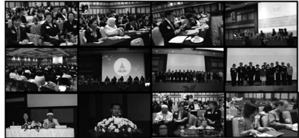
Thai Health Professional Alliance Against Tobacco (THPAAT) Meeting 2011 March 18, 2011