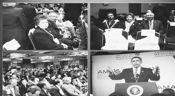
Annual Meeting of the House of Delegates of AMA June 13-17,2009