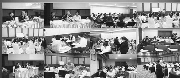
Thai Tobacco Cessation Workshop May 6-8,2010