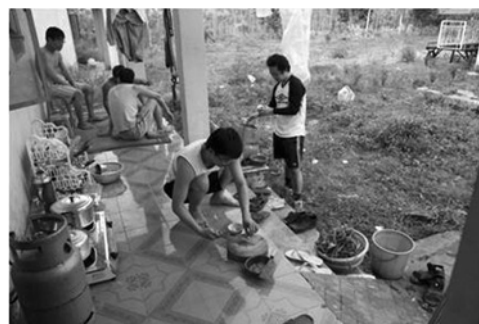
Japanese and Vietnamese staff cooking during field activities in Vietnam

Our department raises the following three activities as international contributions: advocacy on international health at the national and international level through dialogue with government in collaboration with NGOs and civil society in the process of G8 or TICAD (Tokyo International Conference on African Development), in which global health including infectious diseases, maternal and child health, and health system strengthening in developing countries has recently become one of the main agendas; health promotion and empowerment of people, especially women, through a project conducted in collaboration with Japan International Cooperation Agency (JICA) or another implementation body at the community or grassroots level; and international emergency relief. Speaking of emergency relief, I myself was dispatched as a member of Japan's Disaster Relief Team to Haiti hit by a devastating earthquake