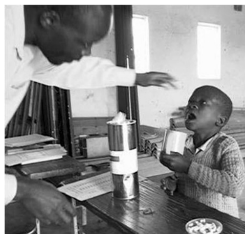
Schistosomiasis control in Zimbabwe

etc., seems to be the unconscious role that the university plays. I believe this unconscious role taken by the university is an asset that the university has in its history.