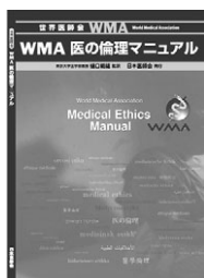
Fig. 2 Japanese version of the WMA Medical Ethics Manual

The WMA published its Medical Ethics Manual in 2005, and 15 translations have been completed and distributed throughout the world. The Japanese version was completed in 2007.