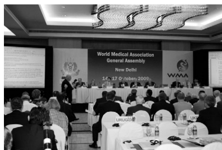
WMA General Assembly 2009, New Delhi

The WMA published its Medical Ethics Manual in 2005, and 15 translations have been completed and distributed throughout the world. The Japanese version was completed in 2007.